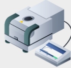
LOSS ON DRYING